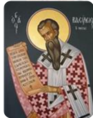
Icon of St Basil

The teaching of St Basil is reflected in the work of St Basil's Aged Care Services, thus continuing a tradition of 1600yrs.